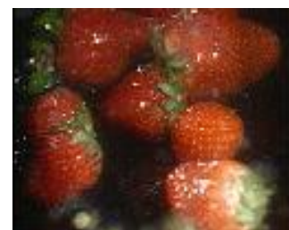
(a) Query Image