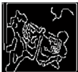
(b) Edge image