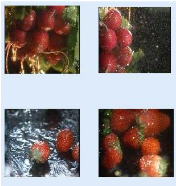
(b) Retrieves relevant images for fruit Figure 2: Query response for fruit

Figure 3 shows output of the fruit class of the database. (a) Query image represent the test image in the CBIR system and (b) Retrieves relevant images for fruit is the output for query image fruit. The performance rate of this system can be evaluated by the two parameters precision rate and recall rate. The precision rate or value is defined as the ratio of the number of relevant images retrieved to the total number of retrieved images. And recall rate parameter is the ratio of the number of relevant images retrieved to the total number of relevant images. These are the two parameters that improve the performance of our system.