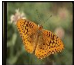
(a) Original image

The coefficients U(n), n= 0,1,...,N-1, are called Fourier descriptors (FD) of the shape. Hence we get 25 FD's from the shape feature vectors. In matrix form we collect 1x25 features.