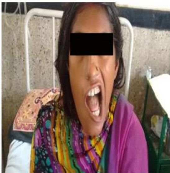
Figure 1: Deviation of angle of mouth to left

wasn't identified. Initially she was treated at district hospital in first twenty four hour. During admission, at our hospital patient complained of decreased urine output, difficulty in speech along with deviation of mouth. (Fig-1). Local Examination oedema, erythema, two fang marks visible on right foot without any bleeding from the site. On Neurological examination pupil bilateral reactive and bilaterally symmetrical, Patient was conscious and oriented, she had motor aphasia along with deviation of mouth left side. no evidence of motor weakness and bleeding manifestation.