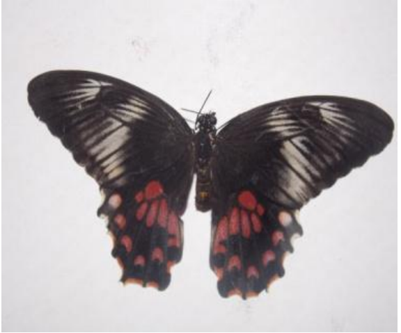
Figure 1: Papilio polytes

two female forms that mimic locally available Pachliopta species. The female limited mimetic polymorphism reaches its apex in Sri Lanka and peninsular India where, in the subspecies Papilio polytes romulus , three female forms fly together: Form cyrus is male-like and non-mimetic form polytes (stichius) mimics Pachliopta aristolochiae and Pachliopta pandiyana (Pachliopta jophon in Sri Lanka), and form Romulus mimics Pachliopta hector .