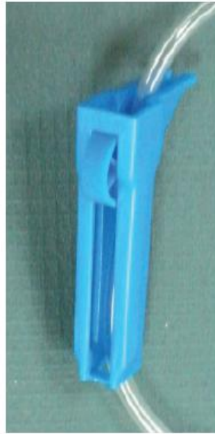
Figure 1: Regulating clamp attached to a giving set to regulate the amount of anaesthetic delivered