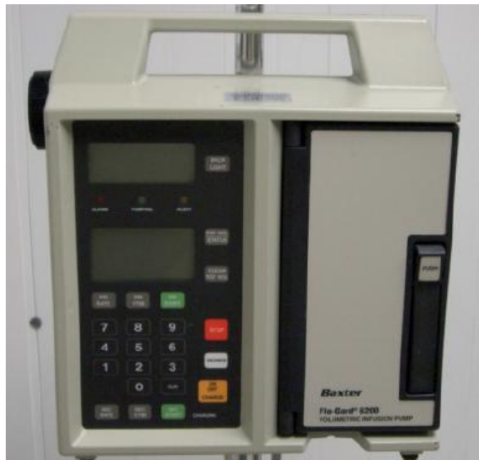
Figure 2: Volumetric Infusion pumps can be used to administer large volume infusions more accurately