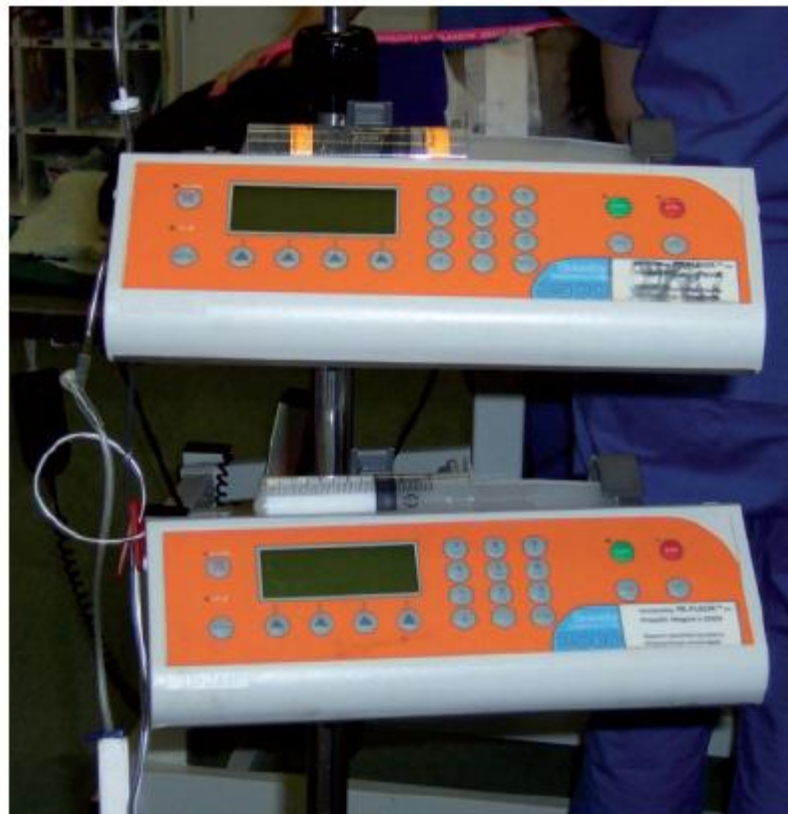
Figure 4: Two syringe drivers set in parallel during anaesthesia of dog. One infuses an analgesic (eg remifentanyl) while the other is a target-controlled infusion system to provide anaesthesia using propofol