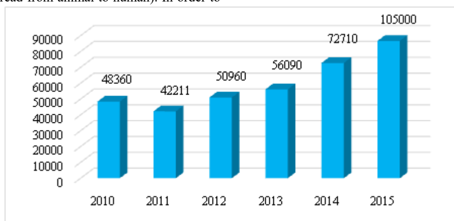
Figure 1: Avian influenza vaccine sales growth PT IPB Shigeta Animal Pharmaceuticals (units in thousand of bottless)

comprehend the spread of AI virus, the company decided to produce AI vaccine as one of the solution towards the spread of this vicious virus spread which causes bird flu in Indonesia.