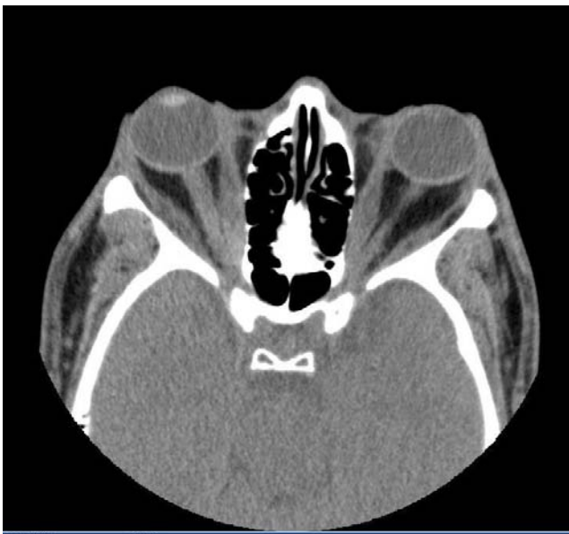
Figure 1: Diffuse symmetric enlargement of the extraocular muscles consistent with Grave's orbitopathy

This case underscores the significance of autoimmune diseases following HAART therapy. Physician prescribing the HAART therapy should be aware with the concept of Immune reconstitution inflammatory syndrome and its early infectious and late autoimmune disease manifestations. IRIS Graves may range from simple symptoms of hyperthyroidism to full blown ophthalmopathy.