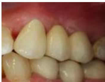
Figure 22: Intraoral view