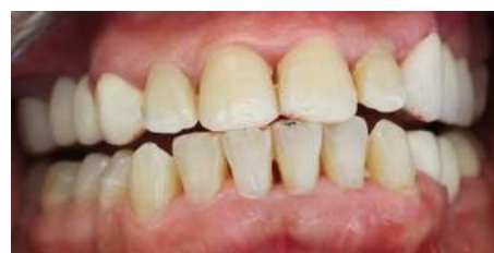
Figure 19: Functional anterior guidance

During the next visit, special attention was paid to the static and dynamic occlusal equilibration. In right lateral movement, the contacts were distributed harmoniously according to the canine function concept 1 (Fig. 19 to 21).