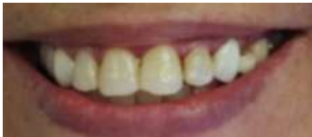
Figure 2: Examination of forced smile

Examination of the occlusion showed normal functions with an efficient anterior guide. The antagonist teeth were rehabilitated by a satisfactory metal-ceramic restoration. Natural teeth were of low translucency. The smile examination showed a broad smile revealing the maxillary teeth to the mesial faces of the first molars. The patient had a medium smile line (Fig.2).