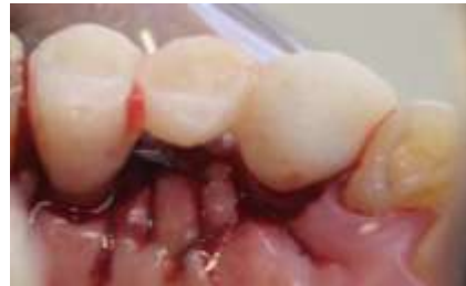
Figure 12: Note the new supra mucosal situation of the pontic after remodeling of the edentulous ridge

In a subsequent session, the surgical phase was initiated. The edentulous ridge was reshaped by oral mucosa thinning. In addition, a surgical crown lengthening was performed at the level of the maxillary second premolar (25) (Fig. 12, 13).