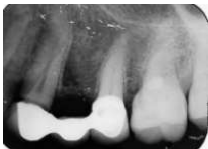
Figure 3: Periapical radiograph in the area of the bridge. Note the poor adaptation of the dento-prosthetic joint and the absence of the interproximal contacts.

Periapical radiograph showed a crown to root ratio less than 1 at the level of the abutment teeth and a bone trabeculae rarefaction in edentulous ridge zone was noted (Fig.3).