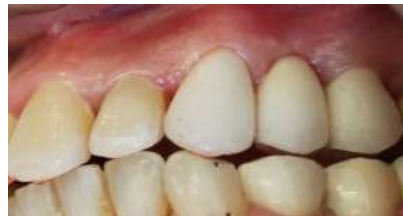
Figure 20: Right laterality showing canine guidance with incisive involvement