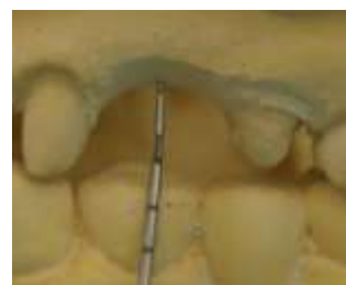
Figure 8: After scraping on plaster, the new POH was measured to 7 mm.

A diagnostic waxing was made to simulate the prosthetic project (Fig.9).