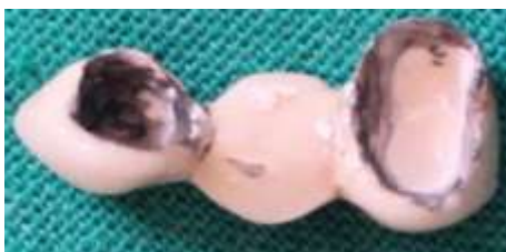
Figure 4: Removed defective restoration: Note the irregularity of the cervical margins as well as the excess cement adhering to the gingival face of the pontic

The space between the gingival surface of the pontic and the residual ridge crest was measured. This space, occupied by the soft tissues, was exaggerated (about 5 mm). A provisional diagnosis of a gingival hypertrophy was retained. Moreover, a small height of the pontic metallic core was noted (Fig.3). This could be at the origin of the fracture of the fragile cosmetic ceramics by the lack of support [2]. After getting informed consent from the patient, the fixed partial denture was removed successfully without destruction. A well opened prosthetic embrasures on either side of the pontic (Fig.4) and a reduced cross sectional area of the connectors were observed.