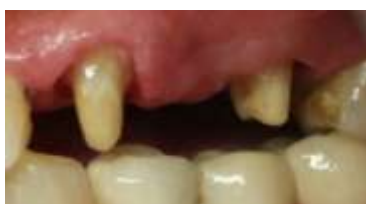
Figure 11: Note the regression of clinical inflammation with, however, the persistence of gingival hyperplasia of the edentulous ridge as well as a pseudopocket around the tooth 25

After provisional luting, the excess cement is removed from around the margins. Then, oral hygiene instructions were given to the patient, especially in relation with the provisional restoration area. At an appointment, a few days later, the periodontium status was reevaluated. We noted a considerable regression of inflammation (Fig.11).