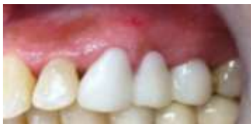
Figure 10: Vestibular view of the transitional prosthesis: a compromise was sought between the various imperatives.

The temporary prosthesis was achieved with a compromise between the esthetic, biological and mechanical requirements (Fig.10). Indeed, the modified ridge lap pontic allowed restoring esthetics by its adaptation to the facial aspect of the residual ridge. However, this vestibular part was thin due to a reduced POH. This means a low resistance to fracture. Another compromise was sought for the connectors in order to improve mechanical strength and at the same time to have easy hygiene. In addition, a well-polished surface was the rule.