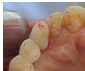
Figure 21: Contacts found at lateral movement

Obtaining a color and a surface state similar to natural teeth is an essential element for a perfect prosthetic integration. To reach this, staining and glazing bakewas carried out in the dental laboratory in the patient's presence. That made it possible to add more saturated color shades to the cervical zone and to characterize the surface condition.