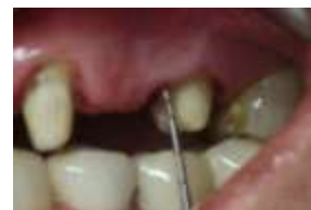
Figure 6: Tooth 25 had a short coronal height. Its free gingival margin was more occlusal than tooth 26.

A cleaning and gingival curettage of the abutment teeth were accomplished. Then, a diagnostic impression was performed. The mounted diagnostic cast was used to simulate our prosthetic project. Simulation began with tracing of new tissue limits presumed after the surgery (Figure 7). This simulation aimed to ameliorate the POH, to elongate the crown of tooth 25 and to align the buccal free gingival margin with that of tooth 26. Subsequently, a diagnostic cast scraping was performed, which made it possible to appreciate the quantity of the tissues to be resected during the surgery (Fig.8).