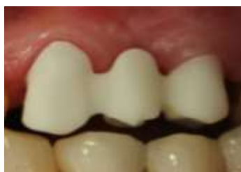
Figure 17: Buccal view of the framework .Note, sufficiently high connectors and space devoted to cosmetic ceramics

In addition, the radius of the gingival side of the connectors was found to be largely sufficient to resist to tension forces. The problem of bonding between the zirconia framework and the ceramic veneer, fragile by nature, led us to recommend a framework design ensuring, by its volume, the maximum support for ceramic veneer, especially at the level of the canine-retainer which is the most exposed to lateral forces (Fig.17).