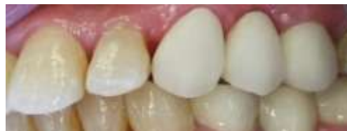
Figure 18: Note the difference in color and the overhangs

After ceramic application, a try-in appointment in the biscuit bakewas achieved. We particularly checked the opening of the embrasures, as well as the pontic/tissue relationship. Imperfections in morphology and color were detected (Fig.18) and required corrections in the laboratory.