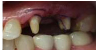
Figure 13: Buccal view: note the increase in the POH and a lengthened clinical crown of tooth 25

Hermetic stitches were performed and instructions were given to the patient to avoid all factors disturbing hemostasis. Afterwards, the cervical margins of the retainers and the gingival surface of the pontic were lined with autopolymerizing resin. Careful polishing was the rule and then the provisional restoration was cemented. Special care should be given to eliminate cement excess to avoid gingival irritation (Fig. 14).