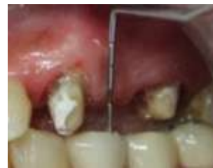
Figure 5: The prosthetic occlusal height quantified by a periodontal probe was less than 5 mm.

gingival margin more occlusal than that of the adjacent molar (Fig.6).