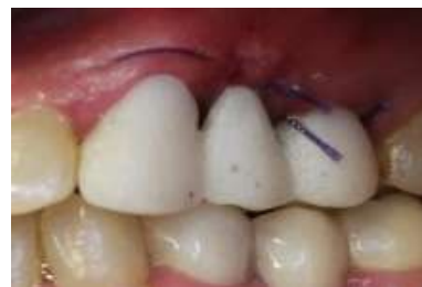
Figure 14: Vestibular view of the lined transitional prosthesis. Note its adaptation to the new situation of the soft tissues with open embrasures.

Hermetic stitches were performed and instructions were given to the patient to avoid all factors disturbing hemostasis. Afterwards, the cervical margins of the retainers and the gingival surface of the pontic were lined with autopolymerizing resin. Careful polishing was the rule and then the provisional restoration was cemented. Special care should be given to eliminate cement excess to avoid gingival irritation (Fig. 14).