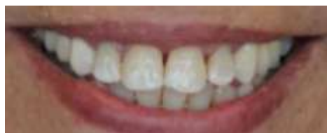
Figure 23: A pleasing appearance of the smile