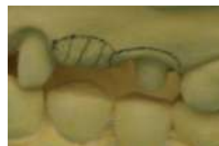
Figure 7: Initial situation on mounted diagnostic models and tracing of new limits expected after the surgery.

A cleaning and gingival curettage of the abutment teeth were accomplished. Then, a diagnostic impression was performed. The mounted diagnostic cast was used to simulate our prosthetic project. Simulation began with tracing of new tissue limits presumed after the surgery (Figure 7). This simulation aimed to ameliorate the POH, to elongate the crown of tooth 25 and to align the buccal free gingival margin with that of tooth 26. Subsequently, a diagnostic cast scraping was performed, which made it possible to appreciate the quantity of the tissues to be resected during the surgery (Fig.8).