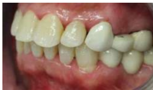
Figure 1: Vestibular view of the old bridge. Note the cervical grayish brown colour at the mesial side of the tooth 25

The retainer on the 25 had a short coronal height and a poor marginal fit. A mal-aligned free gingival margin, an unsatisfactory morphology and a sharp color contrast were notably recorded (Fig.1).