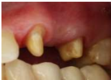
Figure 15: Buccal view: Note the soft tissue maturation

Consequently, a non-compressive global impression was performed by double mix impression technique. Then, the color of the ceramic framework was chosen. A 3-unit zirconia framework (Y-TZP) was fabricated by Indirect CAD-CAM technology (Computer Aided Design-Computer Aided Manufacturing). Then, we checked the design of the framework. We particularly examined, the connectors. We found them sufficiently high, with a cross-sectional area calculated at the mesial connector equal to 8.73 mm 2 and slightly higher at the distal one (Fig.16).