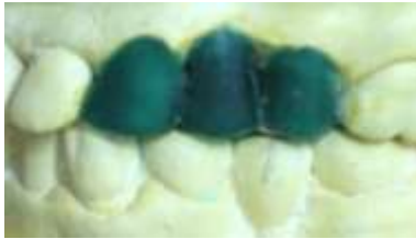
Figure 9: Diagnostic waxing of a three-unit fixed prosthesis to replace the maxillary first premolar.

A custom external surface form was performed with silicone polymer and used to transfer our prosthetic project into the mouth by means of a provisional restoration.