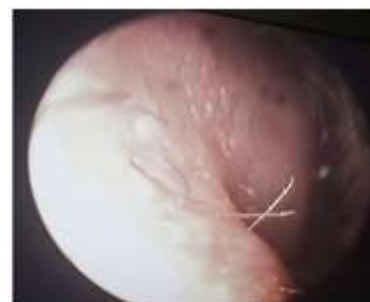
Figure 2: Endoscopic view of the left nasal cavity showing a swelling of the nasal septum.

Emergency CT has objectified a left maxillo-ethmoidal sinusitis complicated by an intra-orbital abscess with communication between the ethmoidal sinus and the orbital cavity through the thin lamina papyracea of the ethmoid (Figure 4A). The nasal septum was the site of bilateral submucoperichondrium filling with destruction of the anterior part of the septal cartilage (Figure 4B).