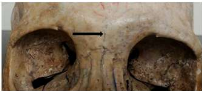
Figure 2: Partial Metopic Suture Linear type