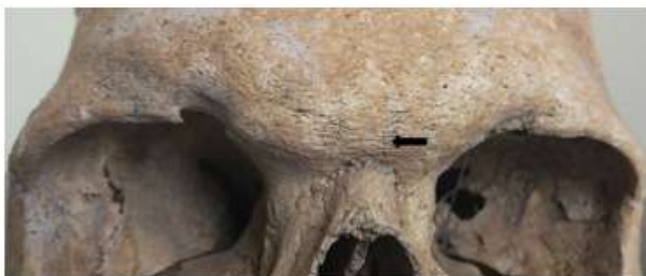
Figure 3: Partial Metopic Suture Double variety