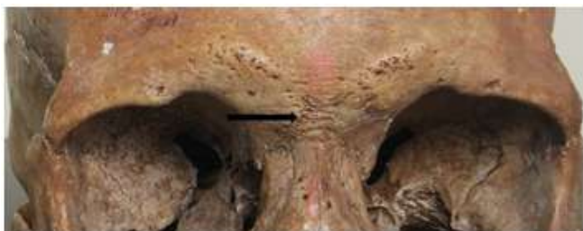
Figure 4: Partial Metopic Suture V-shaped