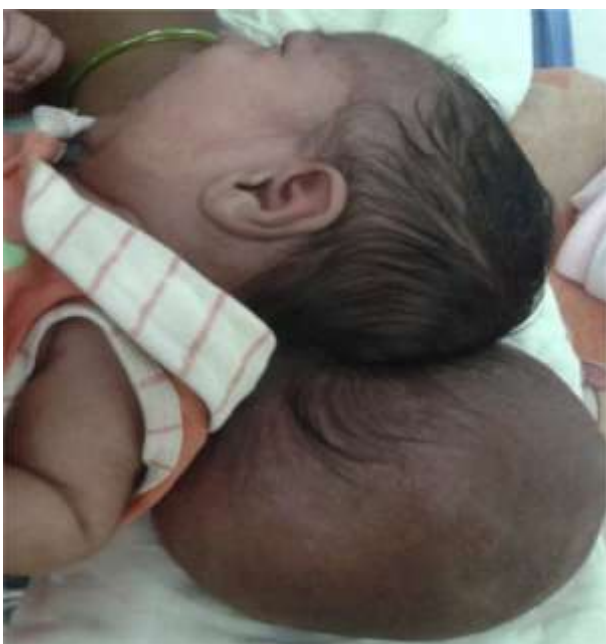
Figure 1: Huge occipital meningoencephalocele in a neonate.