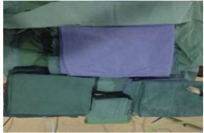
Figure 3.2: Arrangement for positioning neonate for intubation