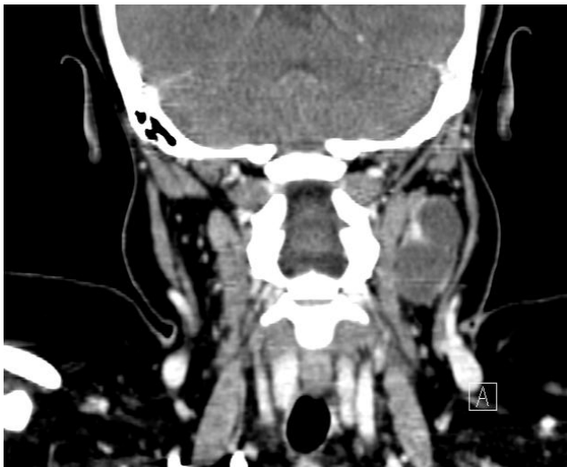
Figure 1 b: Coronal CT scan of the neck with contrast showed cystic mass with multiple reactive lymph nodes