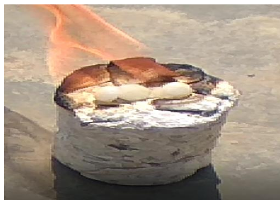
Figure 2.4: Ignition process

As we already know the ignition temperature of paper so in this journal we are finding the ignition time of the biomass of paper.