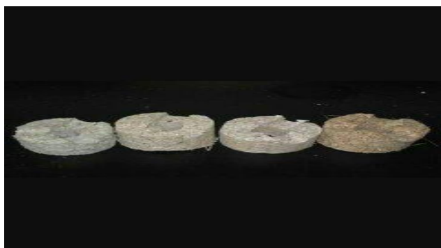
Figure 1.6: Biomass briquettes

“The Below Diagram show the Briquettes that form after the Compression”