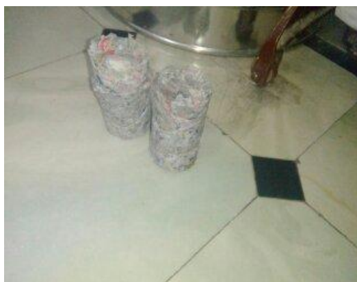
Figure: Day 5

Take the compressor and fill it with paste of papers and the paste of papers will get Compressed and complete water will be drained. Then the biomass is taken out from the compressor. The compressed biomass form a brick structure as shown in figure.