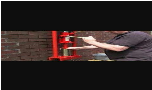
Figure 1.5: Compressor

Compressor is a device which is used to compress the biomass for removing the water content present in it. It has cylindrical container in which biomass is filled and also a movable piston which move horizontally. Piston compresses the biomass, which is controlled by a lever. As the lever is pressed continuously the biomass is compressed by piston and water is drained. The lever is operated by a spring action. Washers are used in cylinder on either sides of the biomass.