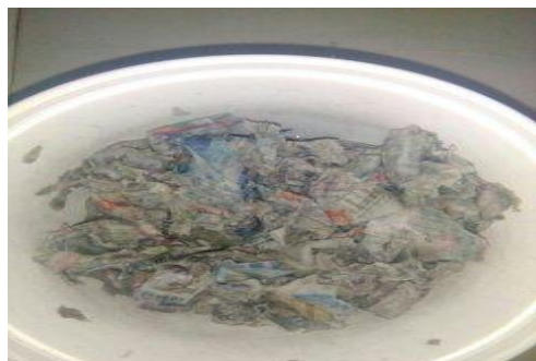
Figure: Day 4