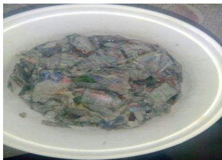
Figure: Day 3