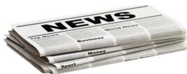
Figure 1.2: Newspaper

Here in this experiment, a newsprint paper which consist of organic matter greater than 95 percentage and inorganic matter may be less than 5 percentage had been used.