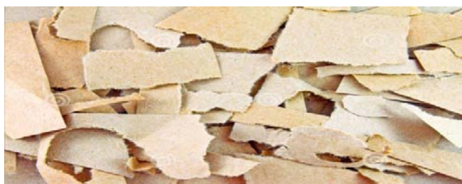
Figure 1.1: Paper Pieces

Biomass is an organic matter which had been extracted from living organisms like plants, animals and humans etc. The Biomass is often used as an energy resource. It produces electricity, heat and many other forms of energies. It is not used as food. It can directly produce energy by combustion to produce heat and indirectly like bio-fuel and etc.