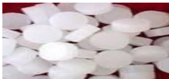
Figure 1.3: Camphor