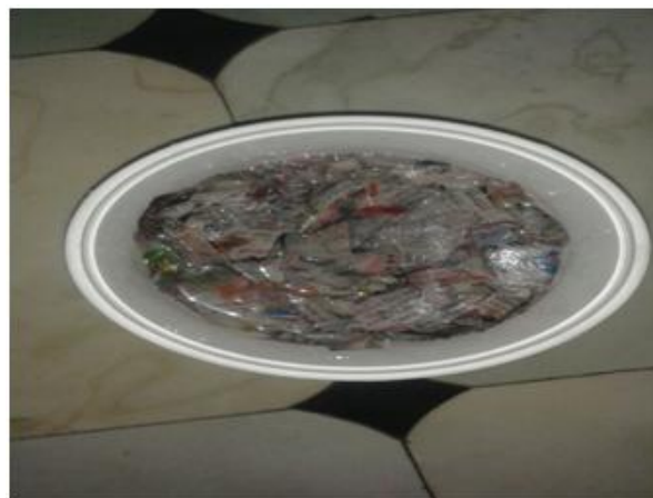
Figure: Day 2

Stir the mixture of paper and water so that the paper will absorb the water and become thicker day by day