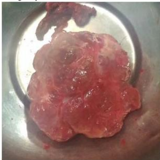
Resected mass – Which was sent for histopath examination and turned out to be Paraganglioma