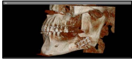
Figure 4: 3D image showing the bone healing after 3 months in isolated mandibular angle fracture fixed with 3D threadlock miniplate.

Figure 3: (A) An immediate panoramic x-rays showing a properly reduced mandibular angle fracture using 3D locking miniplate, (B) An immediate panoramic x-ray showing a properly reduced mandibular angle fracture using a single locking miniplate.