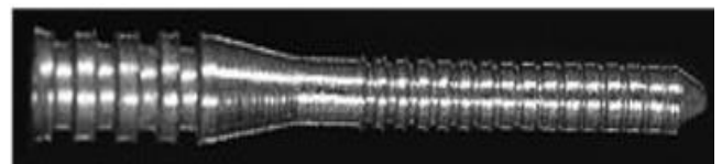
Figure 7: I post

I post is a new post system with unique features developed by integrated endodontics. I post [Figure is a passive, parallel, pillar-like metal post made of stainless steel alloy. This post has a unique design, which compensates the anatomic flare of the coronal part of the root canal.