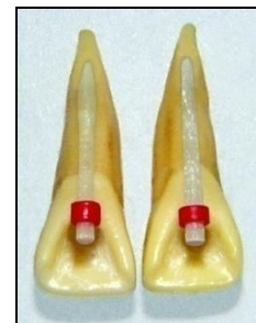
Figure 4: Twin luscent anchors