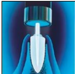
Figure 1: Composit Post

Introduced in 1990 by Duret, Reynaud & Duret.