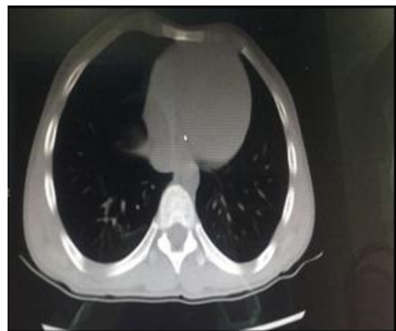
Figure 2: Patient CT-chest

Of note is the corrected serum calcium at 3.21 mmol/L. We excluded other causes of hypercalcemia. There was no evidence of cancer on both CT chest and abdomen [figure 2&3]. (No thiazide diuretic prescribed to the patient for any reason and no other drugs that may contribute to hypercalcemia). Excessive intake of oral calcium or vitamin D was ruled out by meticulous history taking, and during admission. Our patient was only receiving his regular dose of oral alfacalcidol and oral calcium for treatment of hypoparathyroidism.