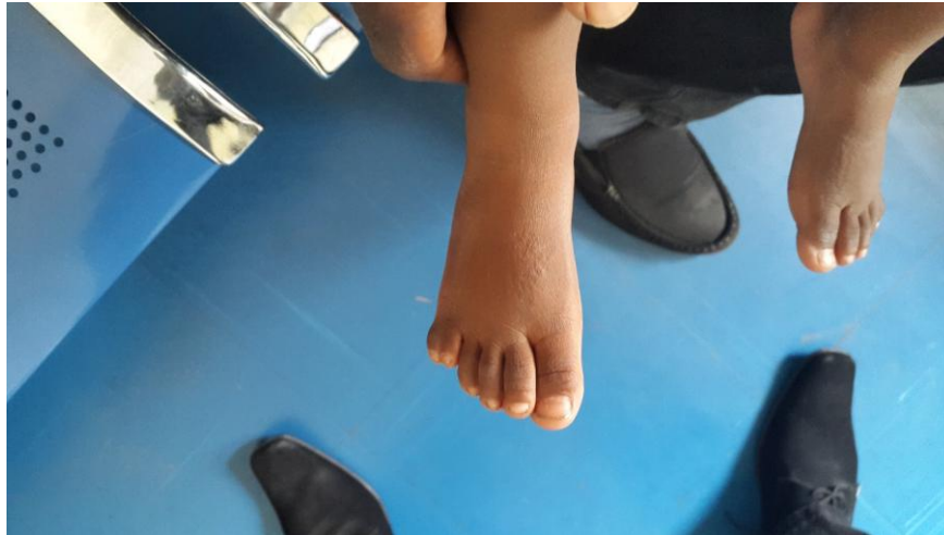
Pre-op: Right foot