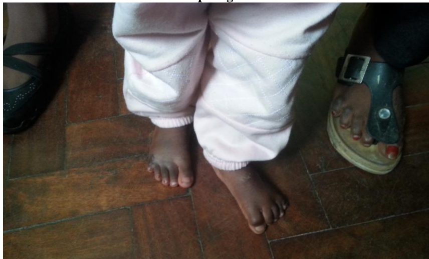
Post op – 10 days