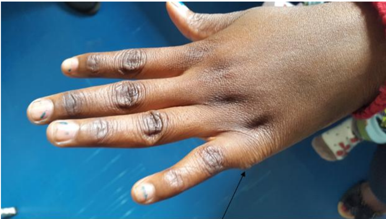
Mother's right hand (Dorsal aspect)