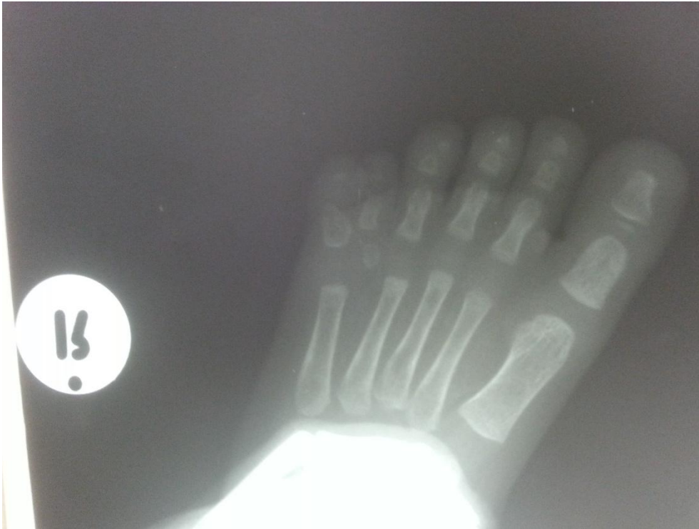
Radiograph: Patient 1 Right side