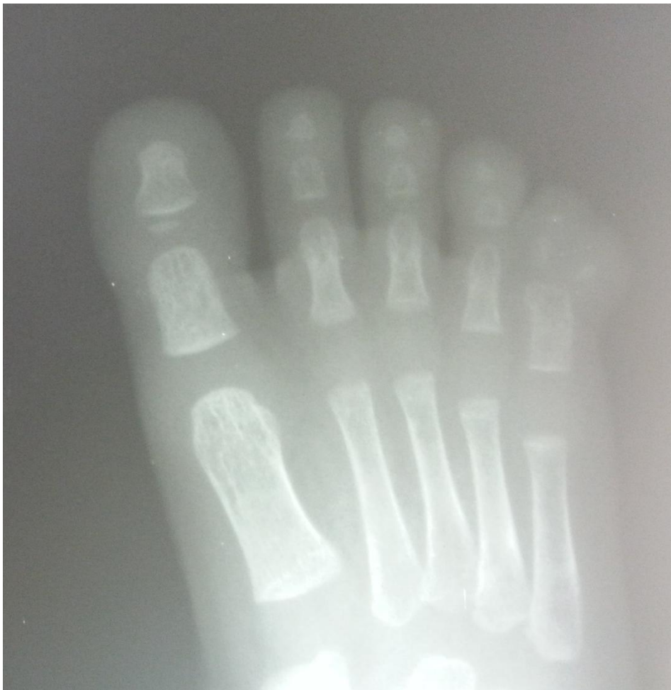
Radiograph: Patient 1 Left side