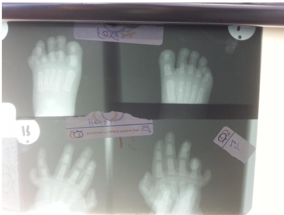
Patient 2: Pre-op Radiographs