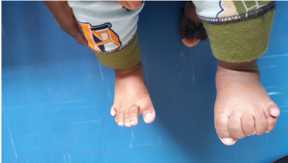
Both feet (Pre-op: Patient 2)