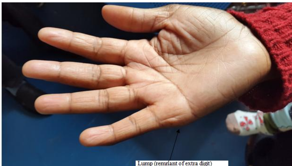
Mother's right hand (Volar aspect)

Those of the family members that had extra-digits on the feet had rudimentary spots on the hands that signified the failed extra digit. This was the case in the mother and many others in their family. The reverse was true for those that had the fully grown extra digits on the hands showed remnants of failed-developed extra digits on the feet. The majority however, of the sufferers in the extended family had all the limbs affected. There was evidence of remnants of the same in the patients' mother's both hands ( see picture below ).