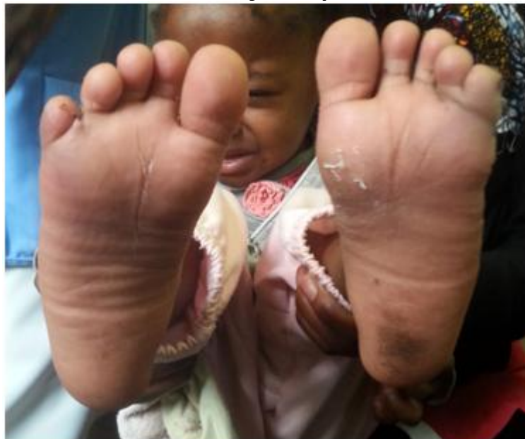
Post of – 10 days