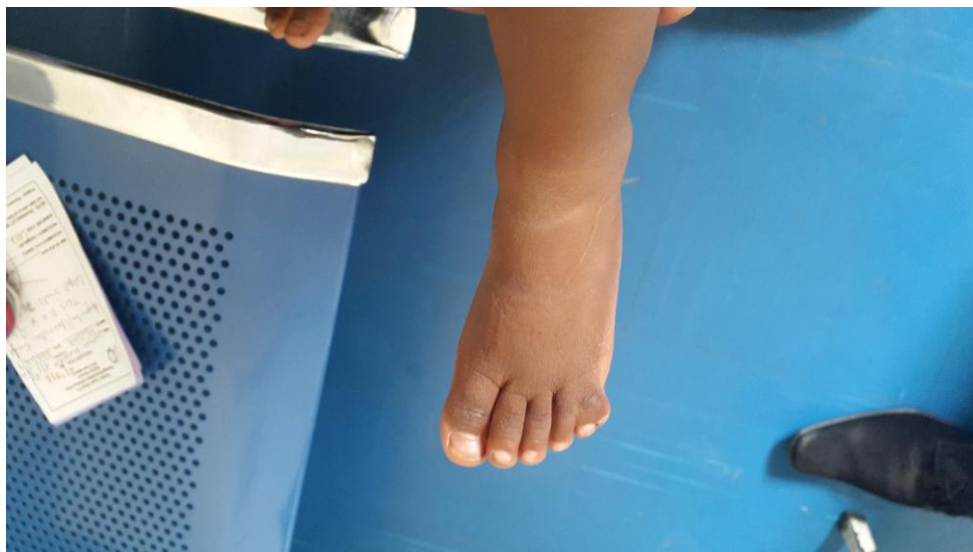
Pre-op: Left foot

The blood investigations were normal while the radiological results showed and confirmed the clinical diagnosis with full skeletal formation in the extradigits. Ultrasound scan of the chest and the abdomen was not significant.