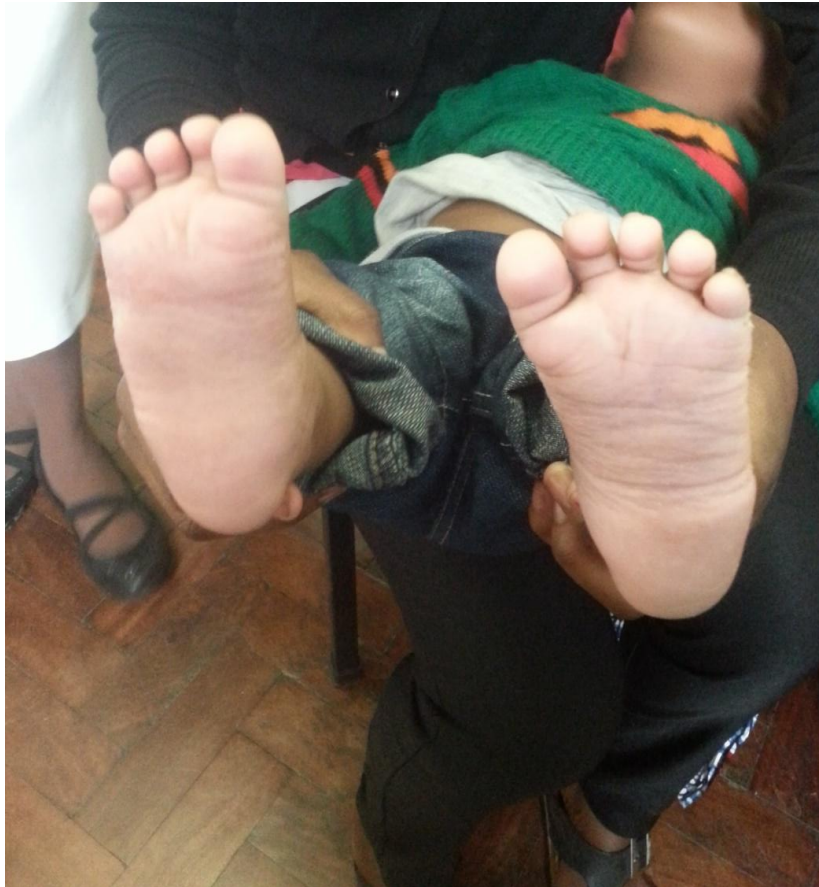
Plantar aspect (Patient 2)