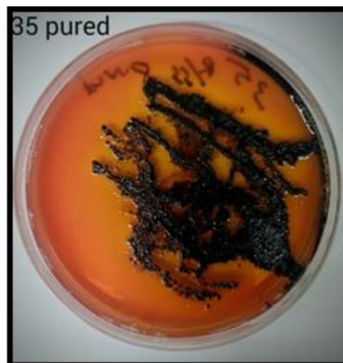
Figure 1: Salmonella colonies with black center on S.S agar after 24 h incubation at 37°C

Ten clinical S. typhi were isolated from blood specimens of hospitalized typhoid fever patients and ten S. typhi were isolated from imported frozen chicken meat samples that were collected from markets in Baghdad randomly using Xylose Lysin Deoxycholate (XLD) agar and Salmonella-Shigella (S.S) agar; identification of the twenty strains at species level was done by Vitek-2 system (Bio-Merieux, France), by using ID-GNB cards according to the manufacturer's instructions (Figure 1).