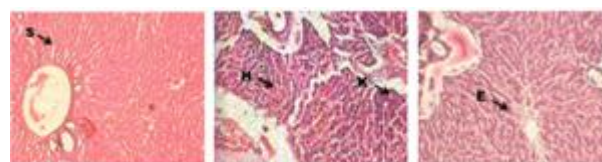
Figure 1 Figure 2 Figure 3

Histological study of liver of normal control group showed normal hepatic architecture having cords of hepatocytes with central vein and sinusoids (S) (Figure 1) whereas the liver section of CCl_4 treated animals showed centrilobular necrosis, kupffer cells (K), damaged hepatocytes (H), with sinusoidal edema and loss of hepatic architecture (Figure 2). The section of liver tissue treated with silymarin along with CCl_4 showed normal hepatocytes with few inflammatory cells and edema (E) of sinusoids, however maintaining normal hepatic architecture (Figure 3). Similar histopathological findings in liver of silymarin with CCl_4 treated rats have also been reported previously [26-28].