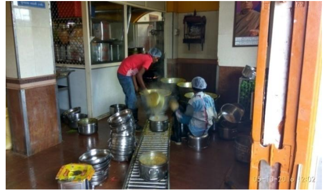
Figure 2: Activities in Centralized Kitchen at ISCON Temple