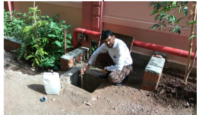
Figure 4: Evaluation of depth of wastewater flow

Average water requirement for various activities in kitchen per day as per survey were 12000 lit/day and during the process they are producing wastewater of 10KL per day. Also while field survey of various centralized kitchens, restaurants and hotels found that approx. all these food serving units are generating 5 KL to 10 KL effluent by their individual unit.