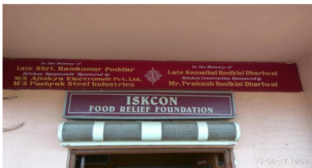
Figure 2: Centralized Kitchen at ISCON Temple

The quantity of waste water generated through kitchen has evaluated during morning and evening session. The quantity has determined with diameter of pipe and depth of flow through the pipe per unit time. The depth of flow through pipe has been checked for 5 mins periodically.