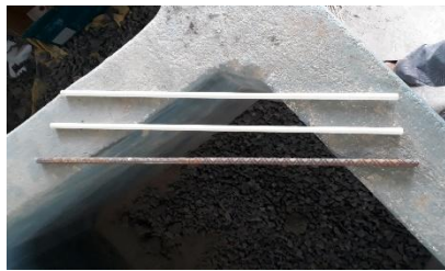
Figure 1: GFRP bars

As per recommendation of IS: 456(2000), the water to be used for mixing and curing of concrete should be free from deleterious materials. Therefore, potable water was used in the present study in all operations demanding control over water quality.