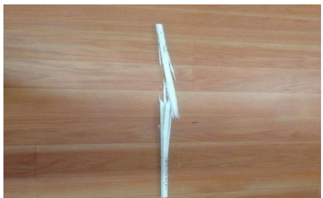
Figure 2: Tensile test on GFRP bar