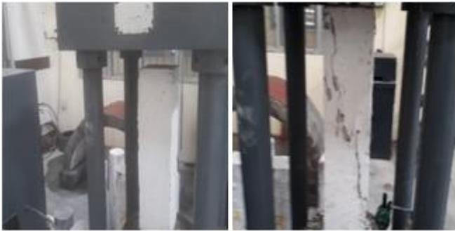
Figure 3: Compression test on GFRP & steel column

the major parameters compared are strength, deflection, and various crack patterns of the columns.