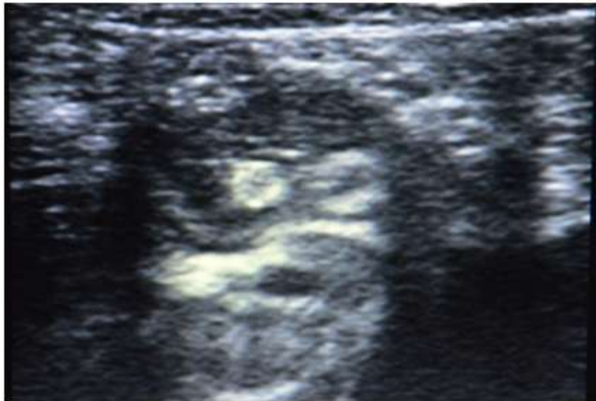
Figure 2: Showing Ascariasis Lumbricoides in the transverse planes the worm in traverse plane