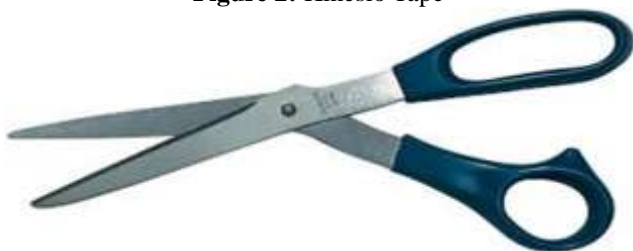
Figure 3: Scissors