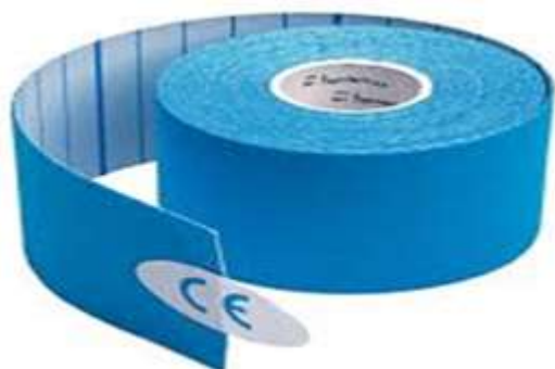
Figure 2: Kinesio Tape