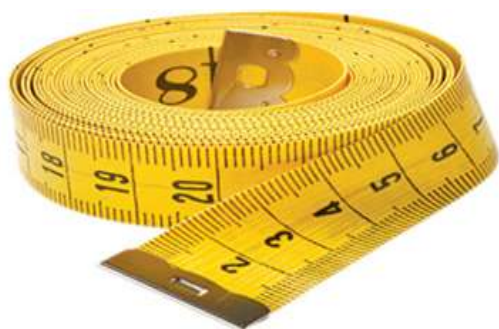
Figure 4: Measuring Tape