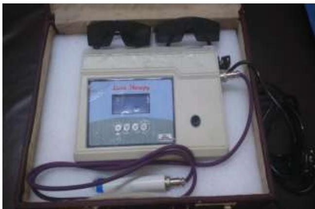
Figure 1: Laser Machine