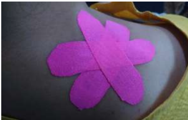
Figure 7: Kinesio Taping [Approximation Method]