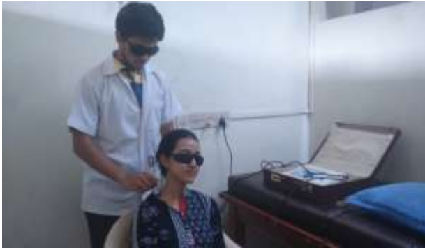
Figure 6: Laser Therapy for Trigger point