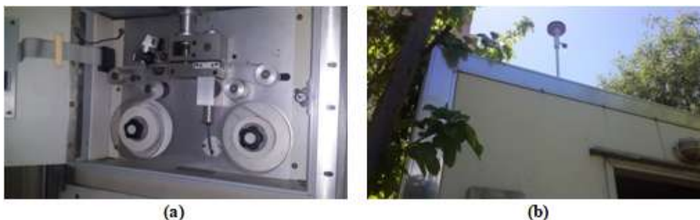
Figure 1: Some images from Adiyaman air pollution station (a) PM 10 measurement system, (b) particulate matter accumulation

station have been employed at the developed software. And PM 10 , SO 2 and HKI parameters can be monitored belonging to Adiyaman air pollution station in real-time. Images from Adiyaman air pollution stations are given in the following figure.