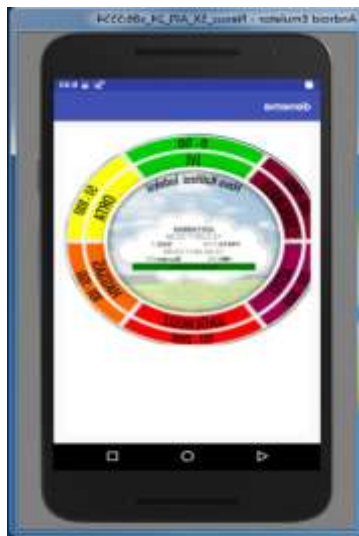
Figure 3: Application of the developed software interface is Arduino.

Moreover, air pollution monitoring system in PHP was developed using cURL in Android operating system. This operation is simply done with a tool that calls a website over Android. The interface of the software monitoring air pollution quality level for Adiyaman Province is given below figure.