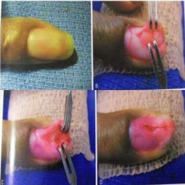
Figure 4: A. Subungual glomus tumor with bluish discoloration. B. Nail removed and nail bed incised to expose under glomus tumor. C. Glomus tumor excised with preservation of nail bed. D. Nail bed sutured.