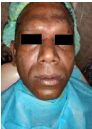
Figure 3: Post Operative image

Reduction of nasal bone was done with digital manipulation (fig 3) and there was no post nasal bleeding or septal hematoma. Patient was well tolerant to the procedure and was kept on a regular follow up. There was no post reduction deformities noted in this patient on 3 months follow up.