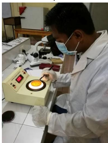
Figure 8: Counts of Bacterial colony

For the determination of total viable bacterial count, 1 ml of each ten-fold dilution was transferred and spread on duplicate plate count agar using a fresh pipette for each dilution. The diluted samples were spread as quickly as possible on the surface of the plate with a cotton bud. One cotton bud was used for each plate. The plates were then kept in an incubator at 37 for 24-48 hours. Following incubation, plates exhibiting 30-300 colonies were counted by the digital colony counter machine. The average number of colonies in a particular dilution was multiplied by the dilution factor to obtain the total viable count. The total viable count was calculated according to Icrate MSF 1998. The results of the total bacterial count were expressed as the number of organism or colony forming units per ml (CFU/ml) of feces sample.