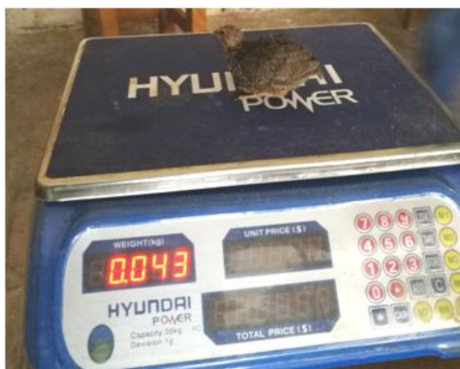
Figure 6: Measurement of body weight

Body weight of each bird was recorded at five days interval with the help of digital balance.