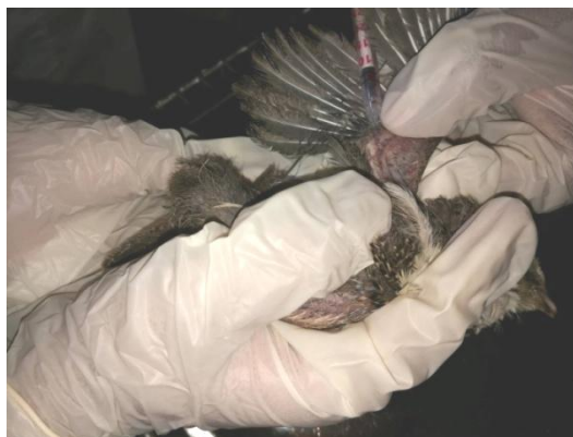
Figure 9: Blood Collection of Quail from wine vein

0.5 ml blood from each group was collected from wing vein with the help of syringe (1 ml) and needle. The collected blood was sent to the Tavfiqve Agro Lab, Rangpur, Bangladesh for the estimation of different blood parameters such as TLC (Total Leucocytes Count) and DLC (Different Leucocytes Count). The blood parameters were determined by semi automatic haematological analyzer machine (cure inc. U.S.A.).