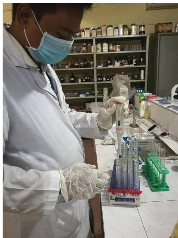
Figure 7: Prepared Serial dilution

The number of total four feces samples were weighted 1 g individually on digital weighting balance and diluted into 100 ml PBS solution as serial 10 fold dilution.