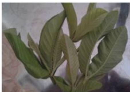
Figure 4: Guava Leave