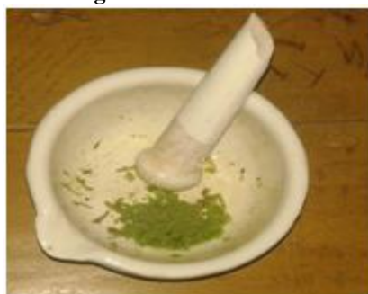
Figure 5: Mashed of guava

The guava juice was supplied to the quails of T 2 group with drinking water @ 1.5 ml per 100 ml drinking water for 10 days.