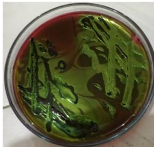
Figure 3: Test organism metallic sheen product by E. coli on EMB agar