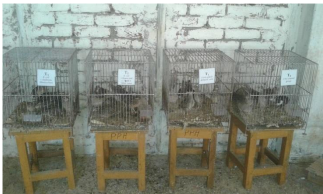
Figure 2: Japanese quail in experimental shed

Nutrient broth (NB) was used to grow the organisms from the collected samples before feeding the quails orally (Cheesebrough, 1985).