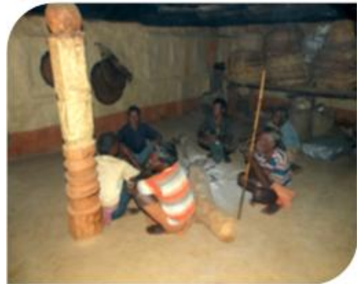
Inside view of Majang with Rusi Dhuni (sacred fire)