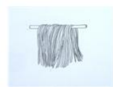
threads are left to dry on bamboo