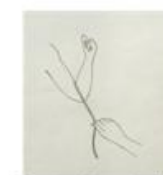
Evaluating the end result