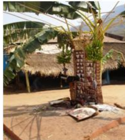
The picture showing motifs and designs on village deity

Dongria believe that red, green and yellow are the most auspicious colours. Red signifies blood, sacrifices and revenge while green symbolizes their fertile mountain ecology. Yellow symbolizes the origin of the Kondh. It also represents prosperity and profuse turmeric cultivation. Other colours are expressive of their ingenious craftsmanship and aesthetic sense.