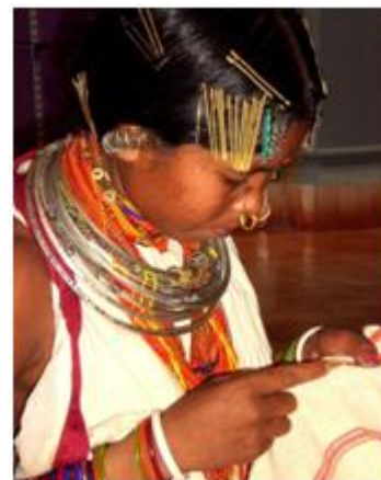
The maiden doing embroidery on shawl

Embroidered with colourful motifs and designs on both sides, Kapdaganda is a prestigious shawl of Dongria Kondh tribe, who inherits their custom, tradition, believes generation to generation in it. Woven with excellent craftsmanship, this shawl is specifically prepared by the spinsters of Dhangidibasa (female dormitory) during leisure hours. It is used by Dongria Kondhs of all ages irrespective of gender. Kapdaganda is gifted by the Dongria girls to their beloved ones as a token of love. It is also presented by them to their brother and father as a symbol of affection to strengthen consanguinal relations. Aesthetically added designs and motifs in the shawl unfold social beliefs and religious practices.