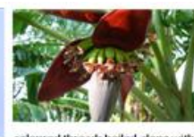
coloured threads boiled along with banana flowers to strengthen colours.