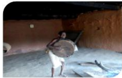
A Juang male plying changu inside Majang