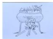
Threads dyed according to requirement

The white thread is procured the local Domb community. The threads are dyed according to the colour requirement. They use turmeric, bean leaves and wild seeds to colour yellow, green and red respectively. To prevent the colour fading they boil the banana flower in water and dip the coloured threads in it. To check the result they hold and press the thread in the arm and dry it on a bamboo pole. This technique is now almost extinct and is replaced by the ready-made colour threads.