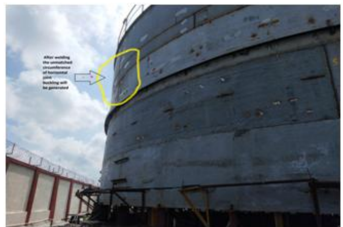
Figure 4: After Welding the unmatched Circumference allowed by Api 650

But after the welding of horizontal joint with the unmatched circumference completed, buckling came at the places where horizontal alignment ended. This situation can be seen in figure 4, where it clearly shows buckling at places where the circumference is unmatched. As this places can't be cut & weld more than twice (as per API 653) & the more this joint are cut, the lesser are chance of getting it corrected.