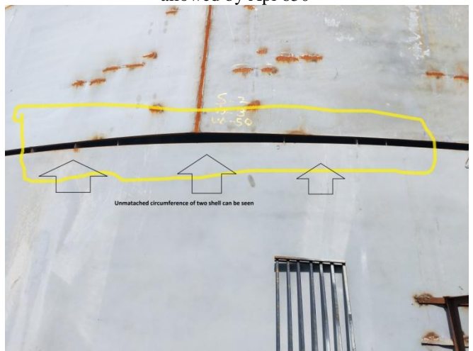
Figure 3: Before welding the unmatched Circumference allowed by Api 650