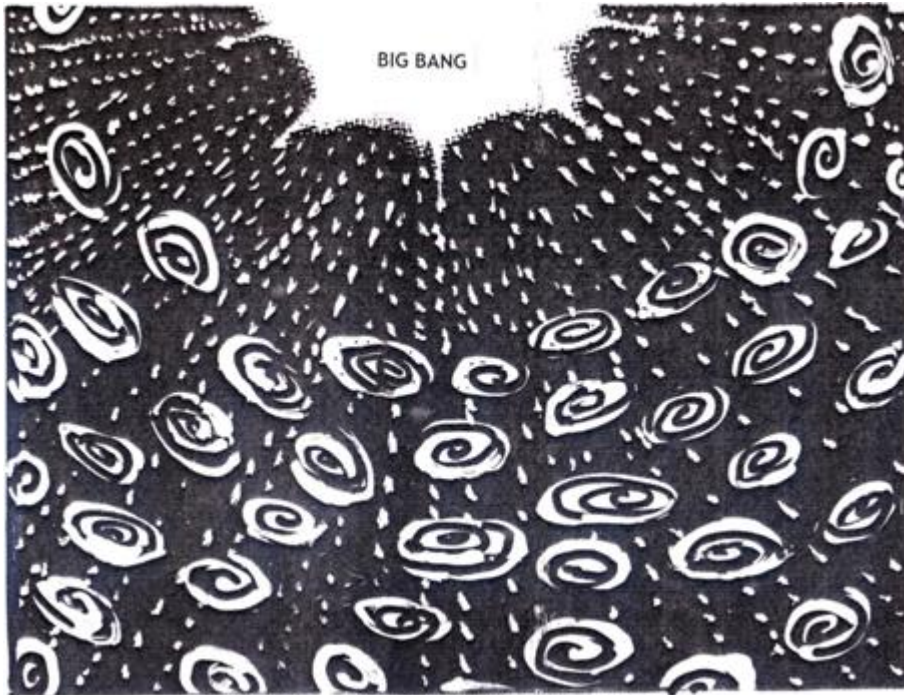
3 The Particles from Big Bang were caught hold by the whirls.