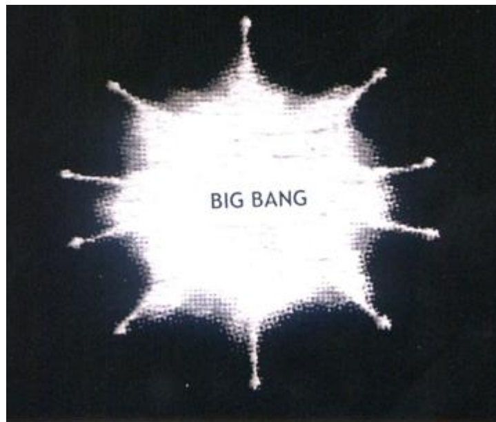
① BIG BANG