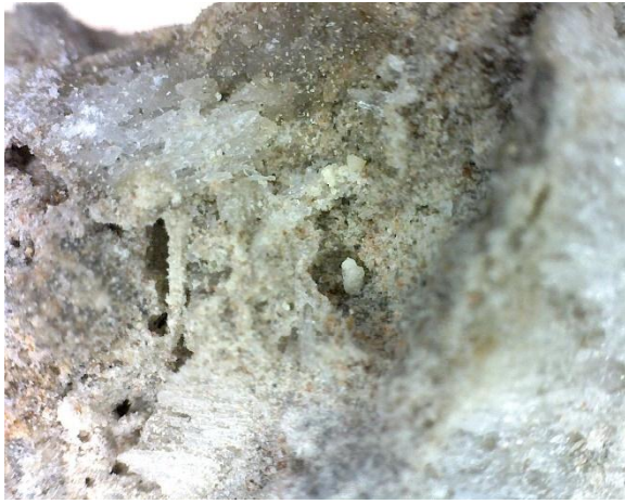
Figure 5: Block 11. Sample XV. Clearly outlined structure of the alabaster crystals. Finely crystalline structure. Small content of clay impurities and veins of fibrous selenite