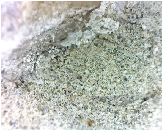
Figure 7: Block 6. Sample IX. Lime and sand content is bigger than cement content. Mortar structure is porish