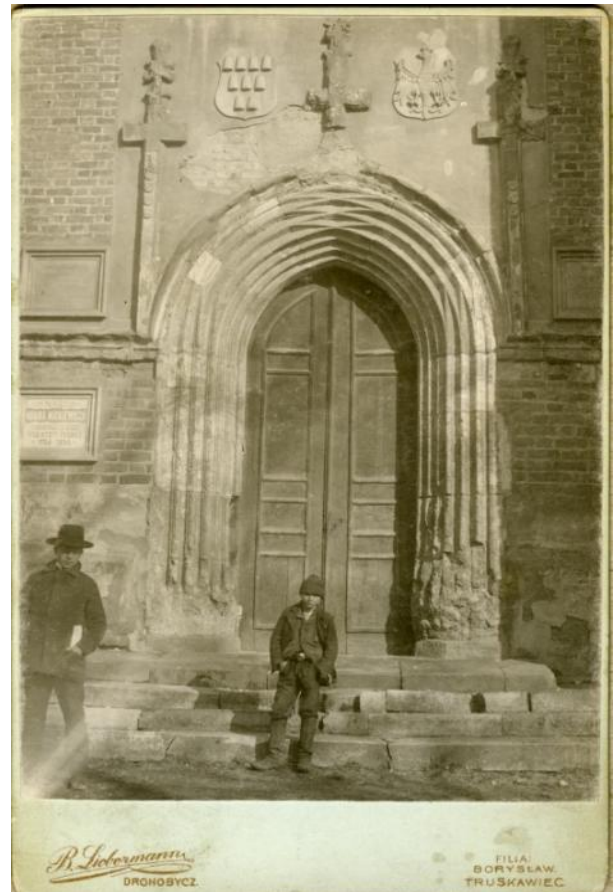
Figure 3: Drohobych, parish church, south portal. [11, p.318]