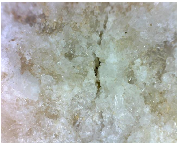
Figure 6: Block 7. Sample XI. The process of water erosion and void formation was observed, which caused the cracks in the stone