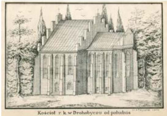
Figure 1: Solecki E. L. Kościół parafialny rz. k. w Drohobyczu (z 2 ma litografiami) // Rocznik Samborski: nowa serja illustrowana: wydawnictwo na cele dobroczynne samborskie. 1884–1885. – R. VIII. – Przemyśl: Nakł. Gothilfa Kohna, 1884–1885. – S. 133.