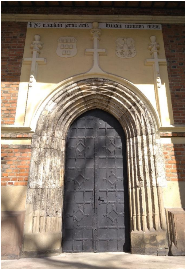
Figure 4: Drohobych, parish church, south portal, 2018