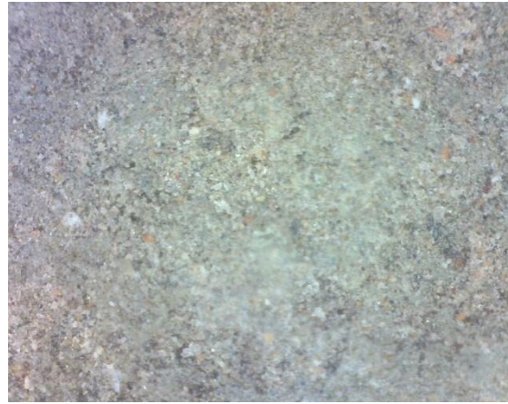
Figure 8: Block 1-2. Sample XIX. Impurities of brick powder and lime