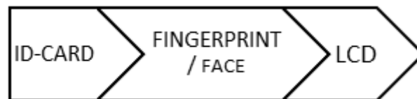
Figure 6: System Flow