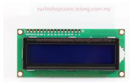
Figure 5: Liquid Crystal Display

It is the output peripheral of the system. As per data matching, relevant text will be displayed. If data of