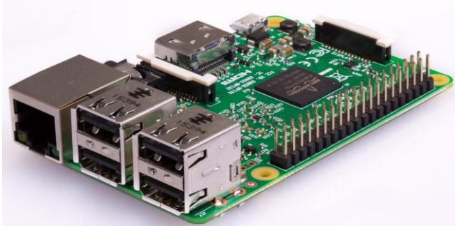
Figure 1: Raspberry Pi

Raspberry Pi is the brain of the system. It is connected with all the sensors. It will be taking input from RFID sensor when the smart card will be detected. For marking the attendance either of the two parameters are required i.e. fingerprint or facial recognition. Input will be taken from this sensors and attendance will be marked absent or present in the database, by the system. Relevant output will be sent to LCD as an output.