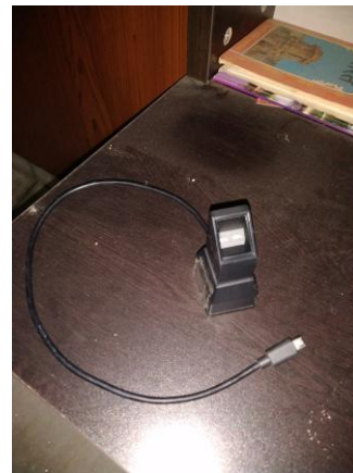
Figure 3: Fingerprint sensor

It detects the fingerprint of the student. As per the data stored of the student in the database if, fingerprint matches that of the student relevant "ACCEPTED" message will be displayed on the display or else "TRY AGAIN" message will be displayed.