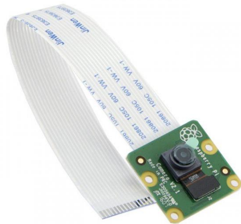
Figure 4: Pi Camera

Pi Camera will take live recording of the students. After the portal is activated, student can decide to mark attendance by either fingerprint or by facial features. Pi camera will take the picture of student in front of the Pi camera. Raspberry Pi will process the image and will give relevant output if the facial features matches that in the database of the particular student.