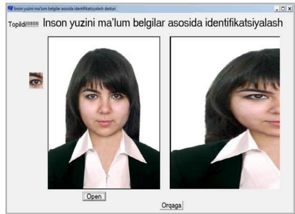
Picture 4: Methods of creating images \ell - - informative characters

objects, m_p - p -is a number of objects in DB. X = \{x^1, x^2, \dots, x^N\} let’s suppose that the space of informative features is given, it is required using it to find similar objects in DB.