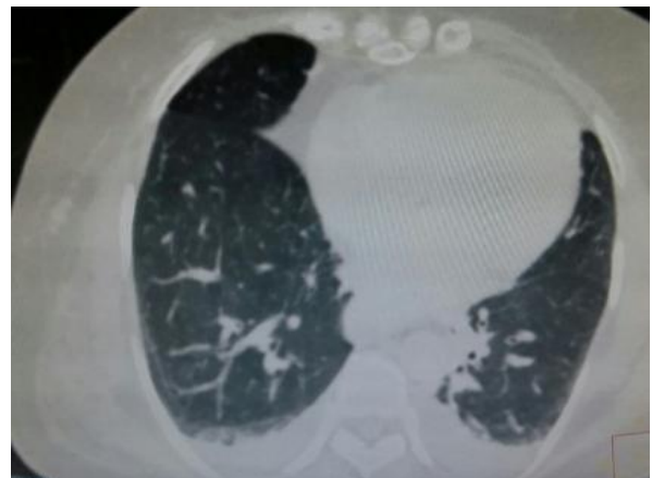
Figure 1: NCCT chest axial view showing bilateral pleural effusion with basal consolidation.

A 60 year old female with no known comorbidities presented to our hospital with fever, cough with expectoration and decreased urine output. Positive findings on systemic examination were bilateral crepitation and rhonchi. SpO 2 was 92% on room air. Laboratory evaluation revealed Haemoglobin: 10.1g/dl, TLC: 52.9/mcl, platelets:11,000/mcl, ESR: 45mm /1 st hour, peripheral blood smear revealed neutrophilic leukocytosis, RBCs showing schistocytosis, schistocyte index 4.5%, fragmented cells:2%, serum creatinine:5.70mg/dl, BUN:100mg/dl, Na/K:128/5.65meq/l, Total bilirubin: 2.67mg/dl, Direct bilirubin: 1.00mg/dl, Urine r/e revealed 15-20 RBCs(hematuria), 5-10 WBCs, 1+ proteinuria(30mg/dl), 24 hr urine protein:153mg, Urine culture revealed Candida albicans 1,00,000 colony count, IAT/DAT(indirect/direct Coombs test) were negative, ANA and ANA profile negative, Reticulocyte count was 1.6% (Corrected: 0.9%), IPF: 6.9%, Fibrinogen: 2.69g/l, Anti c ANCA, pANCA negative, low C3: 953(1032-1495), normal C4:238 (167-385), Anaemia profile revealed iron: 30mcg/dl, ferritin:290ng/ml, folic acid>20ng/ml, vitamin B12>1500pg/ml, LDH: 1109 IU/l. NCCT thorax showed bilateral mild pleural effusion with basal consolidation, subsegmental consolidation in the right middle lobe.