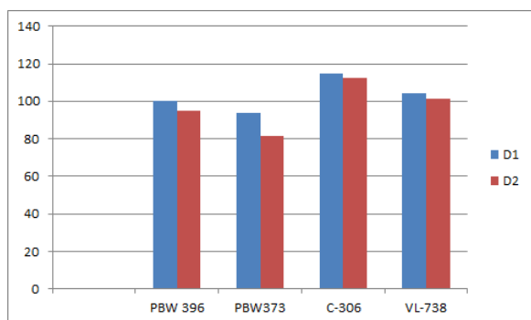
Figure 1: Effect of Differential dates of sowing on plant height of different wheat cultivars. D1 and D2 indicates timely and delayed sown schedule. Data represents the mean values of five independent measurements

The maintenance of internodal distance is associated with the plant height. The data shown in fig. 4.2 indicates differential loss for the internodal length. The first internodal distance seems to be more affected in case sown delayed. However, in contrast to the observations reported here, increase in the internodal length has been reported by Singh and Singh (2001).