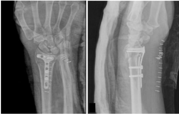
Figure 32: Post-op X-ray.