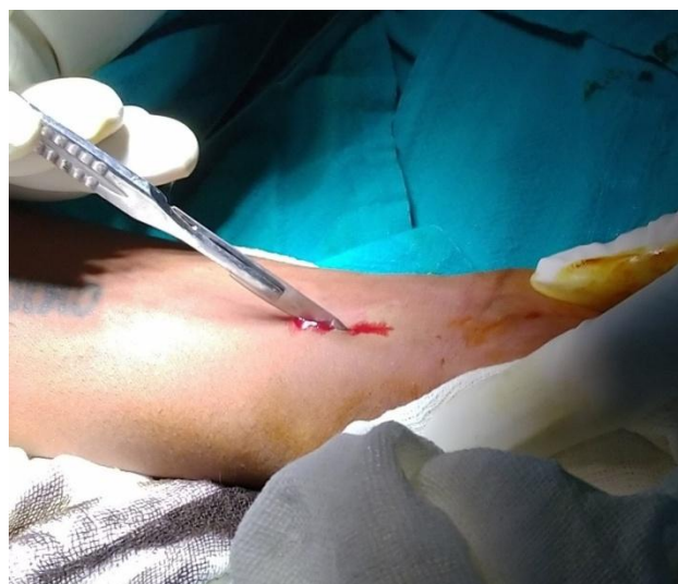
Figure 24: Incision for volar plating.