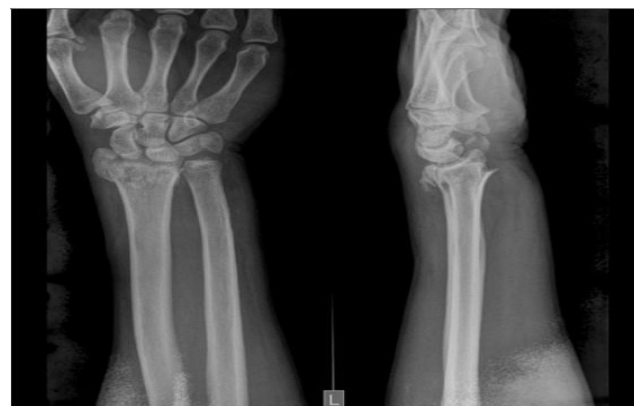
Figure 30: Pre-op X-ray