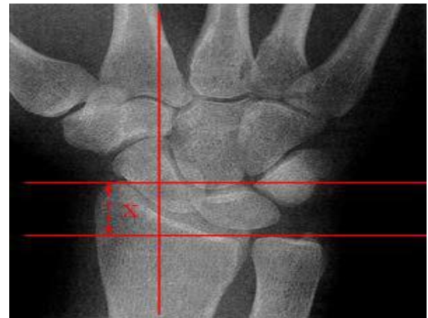
Figure: Radial Height