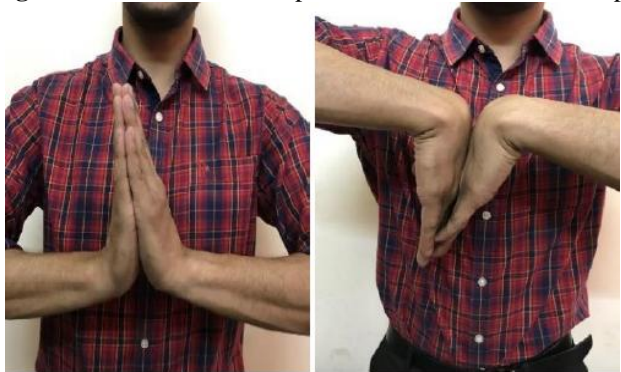
Figure 35: Palmar flexion and dorsiflexion at 12 weeks follow-up