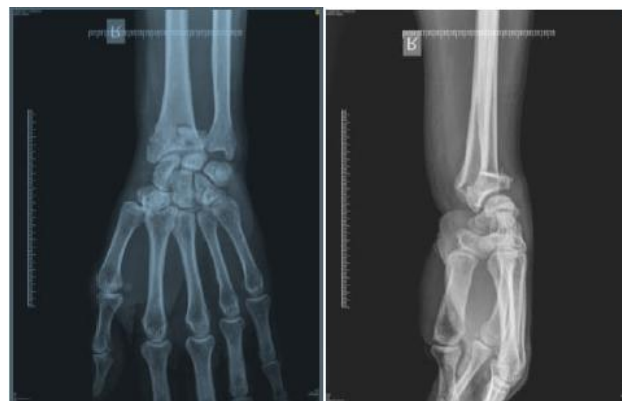
Figure 23: Pre-op AP and lateral X-ray.