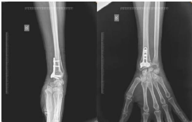
Figure 26: Post-op X-ray