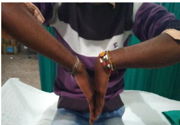
Figure 28: Palmar flexion and dorsiflexion after Volar plating at 12 weeks follow-up