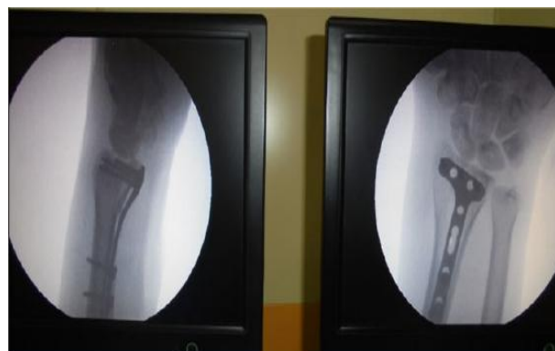
Figure 31: Visualization under C-arm post volar plate placement