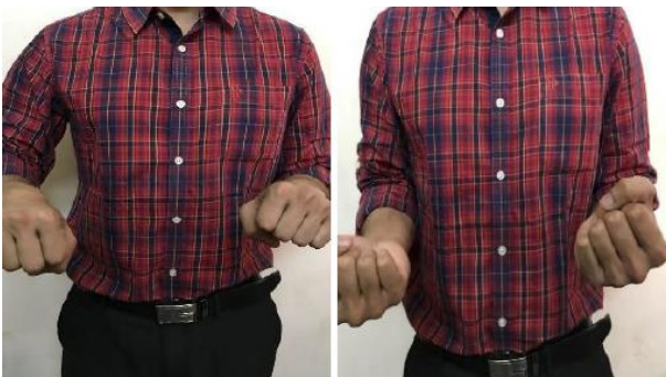
Figure 34: Pronation and supination at 12 weeks follow-up