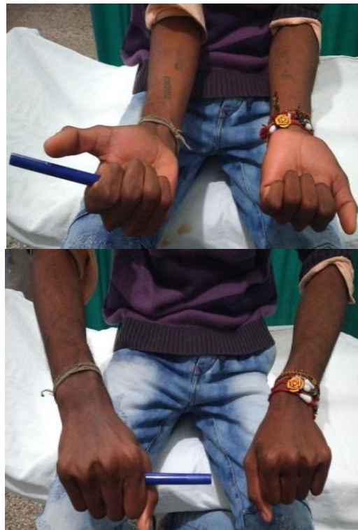
Figure 29: Supination and pronation after Volar plating at 12 weeks follow-up.