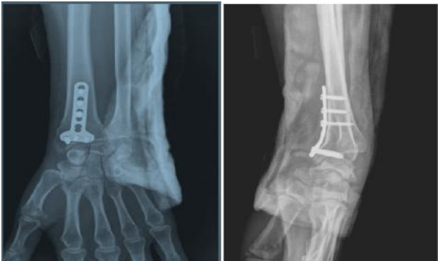
Figure 33: Follow-up X-ray at 6 weeks