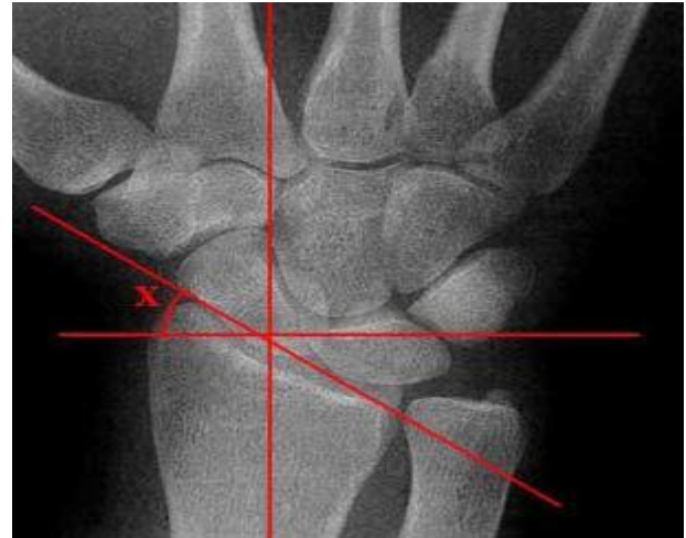
Figure: Radial inclination

In the Lateral view, the VT (Volar Tilt) of the distal radius articular surface is measured. A line perpendicular to the long axis of the radius is drawn, and a tangent line is drawn along the slope of the dorsal-to-volar surface of the radius. The normal angle is 10-25°. [7]