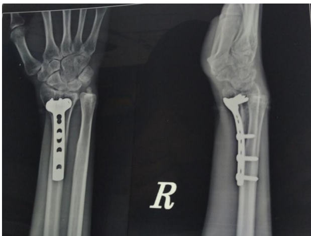
Figure 27: Healed fracture site