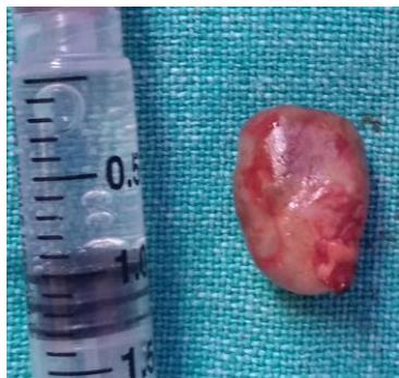
Figure 3: Lesion in en mass