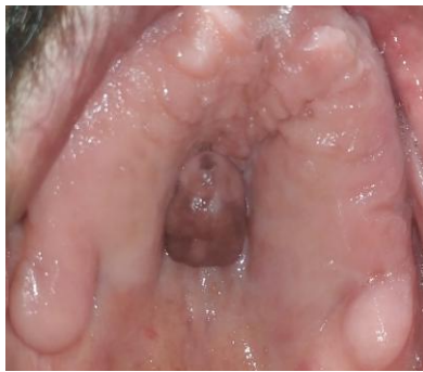
Figure 1: Lesion in the hard palate

The gross specimen was greyish white in color and measured 1.9x1.4x0.7cms. The specimen was cut across to reveal few yellowish gelatinous areas. The specimen was then processed through alcohols & xylene and impregnated & embedded in paraffin wax. Sections of 5µm thick were prepared and stained using haematoxylin and eosin stains. The sections thus obtained showed stratified squamous parakeratinised surface epithelium with short and blunt rete pegs overlying a proliferative connective tissue. The connective tissue was composed juxta-epithelially of dense bundles of collagen that was sclerotic in many foci. The central area showed a collection of adipocytic tissue composed of lobules of mature adipocytes. Blood vessels of varying caliber and some areas of hemorrhage were also noted. The histopathological features were that of a Fibro-Lipoma.