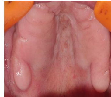
Figure 5: Post operative 9 th month follow up