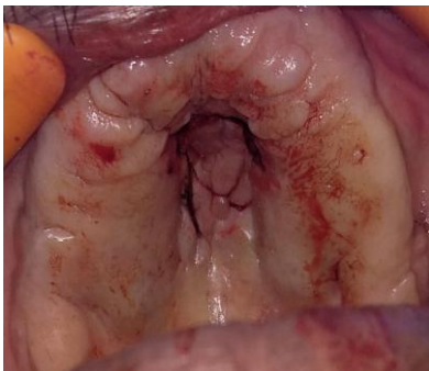
Figure 2: Complete Excision of lesion