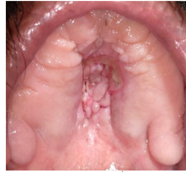
Figure 4: Post operative 1 st month follow up