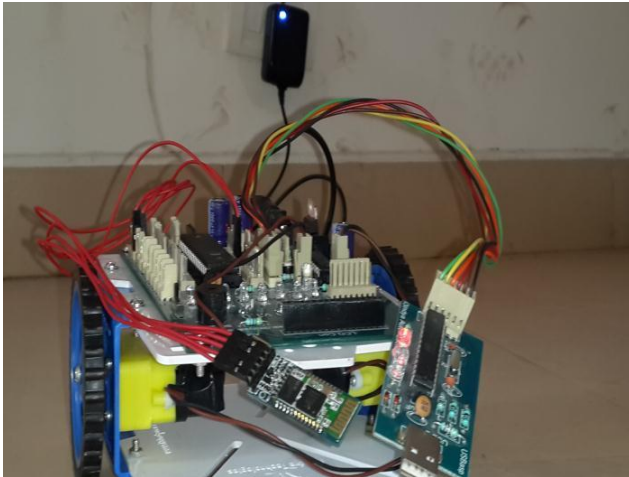
Figure 2: Demo model