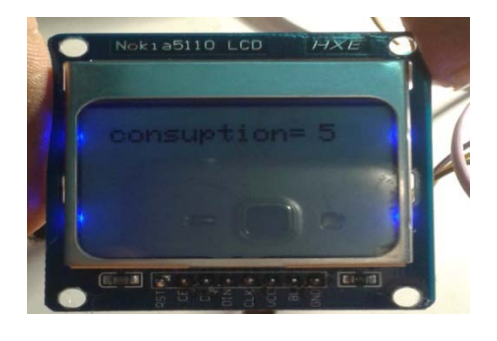
Figure: 3 show electricity consumption

17<sup>th</sup> & 18<sup>th</sup> March 2016