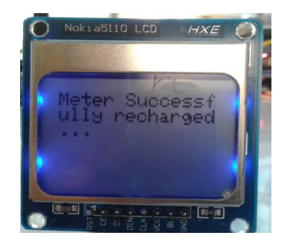
Figure: 2 Acknowledge for user through LCD