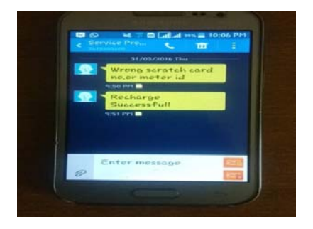
Figure:4 Receive a SMS from user side