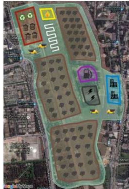
Figure 1: Conceptual design of the urban solid waste management facility, with landfills, photovoltaic panels, incinerator and establishments on site created using Google My-Maps.

New landfill developments as well as significant changes to the existing site would enhance the productivity of the current airstrip that has not been in use commercially since 1988. The area is just under 2 square kilometers and promises development and usage of both small and large scale operations.